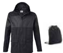
MINI JACKET WITH BACKPACK MEN'S

Grey S–XXXL 80 14 2460806–11 Island S–XXXL 80 14 2460812–17