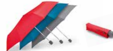
MINI FOLDABLE SIGNET UMBRELLA

Cord: 100% polyester Rotatable carabiner: zinc alloy Grey, Coral, Island 80 27 2460886-88 480 × 12 × 12 mm