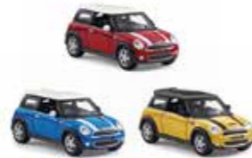
MINI COOPER S PULL BACK

Plastic Blue paint finish/transparent Blue 80 44 2406541 -42 1:32 scale