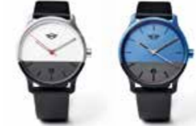
MINI COLOUR BLOCK WATCH

Anodised aluminium, satin finish Silver/Black 80 24 2460900 130 × 11.5 × 11.5 mm