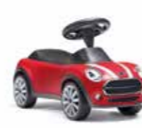
MINI BABY RACER

Steel Chili Red 80 93 2451012 23 × 40 × 62 cm