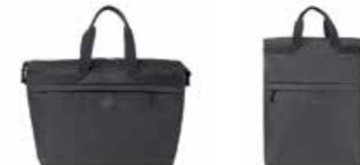
MINI TWO-TONE SERIES

Island, Coral, Grey 80 22 2460867–65 23 × 16 × 35 cm