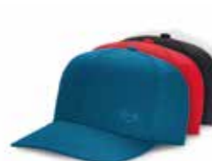
MINI SIGNET CAP