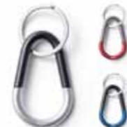
MINI COLOUR BLOCK KEYRING

Brushed stainless steel Silver 80 27 2460885 60 × 34 × 8 mm