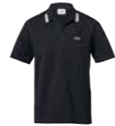
MINI LOGO PATCH POLO MEN'S

Grey/Coral S–XXXL 80 14 2460788–93 Island/Black S–XXXL 80 14 2460794–99