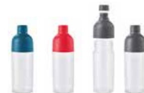
MINI COLOUR BLOCK WATER BOTTLE

FSC-certified pine wood Multicoloured 80 45 2460915 33 × 8 × 20.5 cm