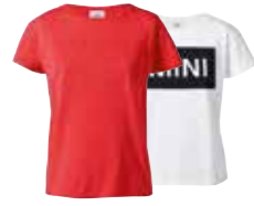
MINI WORDMARK T-SHIRT WOMEN'S