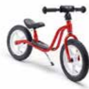
MINI BALANCE BIKE

Aluminium, rubber, polycarbonate Black 80 92 2450930 Front light: 10 × 3 cm Rear light: 3 × 2 cm