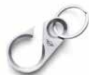
MINI BOTTLE OPENER KEYRING

Brushed zinc alloy, nylon loop Silver/Black 80 27 2445686 190 × 18 × 7 mm