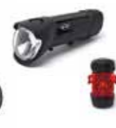
MINI BIKE LIGHT

Aluminium, stainless steel Dark Grey 80 91 2413798 US: 80 91 2454881 Size: 150 × 110 × 60 cm Folded: 85 × 65 × 30 cm