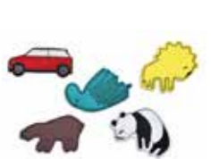
MINI IRON-ON PATCH SET

Cardboard, labels, split pin Multicoloured 80 45 2445729 23 × 32.5 cm