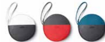
MINI ROUND COLOUR BLOCK POUCH

White/Black, Grey/Coral, Island/Black 80 21 2460858–60 35 × 2 × 26 cm