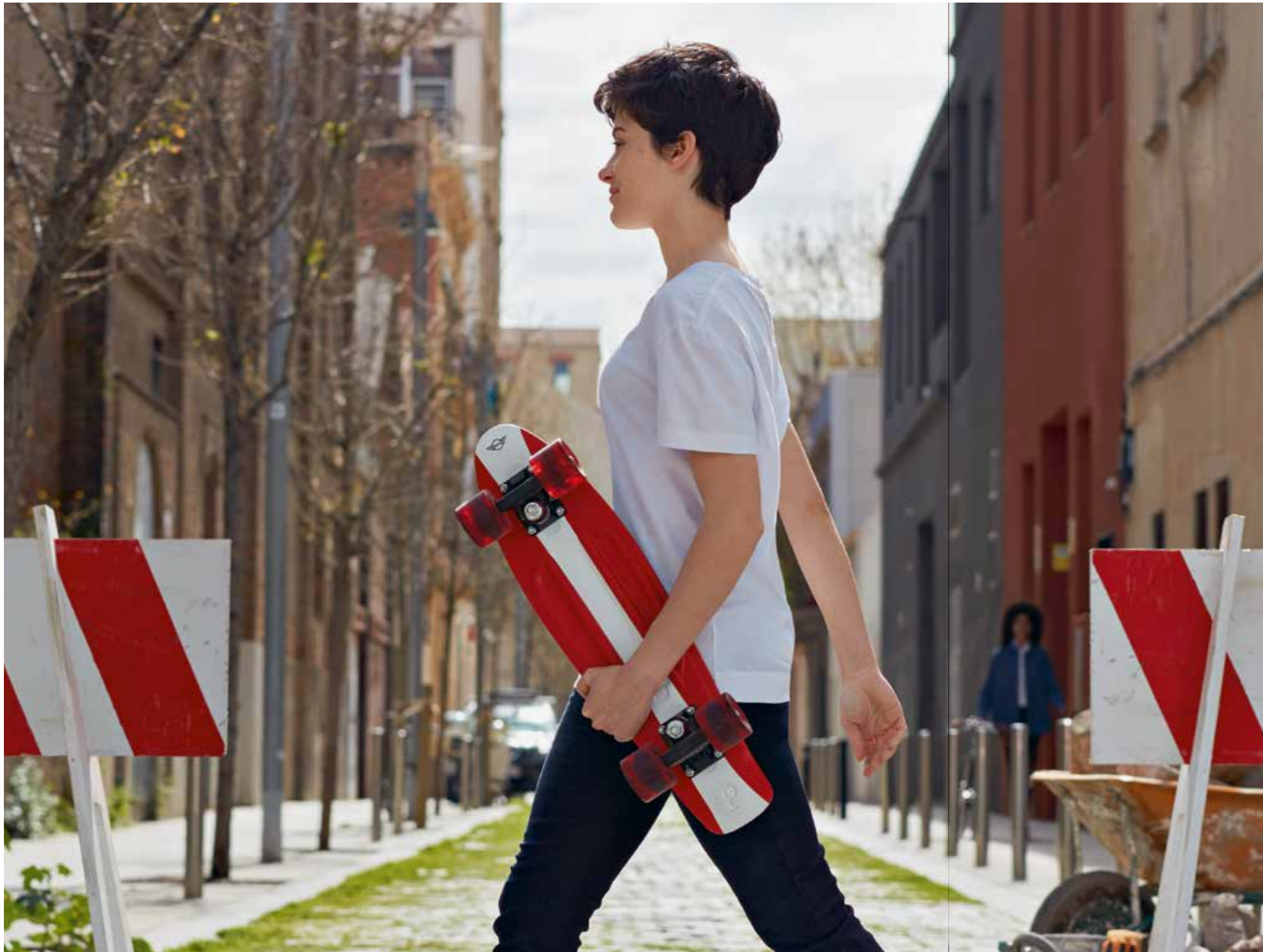
Left and right: Skateboard