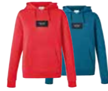
MINI LOGO PATCH SWEATSHIRT WOMEN'S