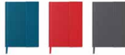
MINI CLOTH-BOUND NOTEBOOK

Magnetic stainless iron, brushed surface Silver 80 28 2445694 22 × 22 × 5 mm