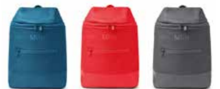
MINI TONAL COLOUR BLOCK BACKPACK

White/Black, Grey/Coral, Island/Black 80 21 2460853–55 15 × 2 × 15 cm