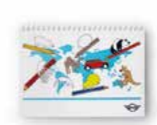
MINI COLOURING BOOK

Paper: FSC-certified Crayons: FSC-certified Multicoloured 80 45 2445712 3 A4 sheets, crayons 9 × 1.6 × 1.6 cm