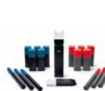
MINI KUBB GAME

Waxed canvas Black 80 29 2445731 27 × 6 × 1.5 cm