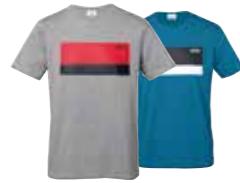
MINI WORDMARK T-SHIRT MEN'S