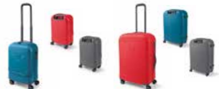
MINI CABIN TROLLEY

WALLET 80 21 2460871 13.5 × 1 × 9.5 cm POUCH 80 21 2460872 22 × 9 × 15 cm