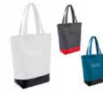
MINI COLOUR BLOCK SHOPPER

White/Black, Grey/Coral, Island/Black 80 22 2445671, 80 22 2460863–64 45 × 25 × 27 cm