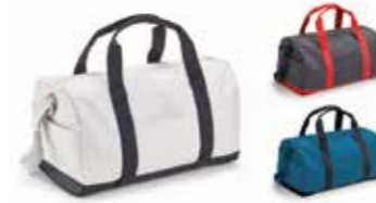
MINI COLOUR BLOCK DUFFLE BAG

Grey, Coral, Island 80 21 2460868–70 8.5 × 8.5 × 0.4 cm