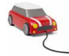
MINI PULL TOY CAR

FSC-certified beech Red 80 45 2460912 16 × 9 × 7 cm