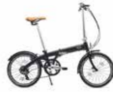
MINI FOLDING BIKE

Aluminium, stainless steel Dark Grey 80 91 2413798 US: 80 91 2454881 Size: 150 × 110 × 60 cm Folded: 85 × 65 × 30 cm