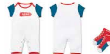
MINI BABY GIFT SET

98% cotton, 2% viscose Multicoloured 80 45 2445714 10 × 7 cm