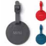
MINI LUGGAGE TAG