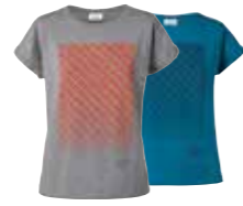
MINI SIGNET T-SHIRT WOMEN'S

Black/White/Island XXS–XL 80 14 2454915–20 Grey/Coral/White XXS–XL 80 14 2454921–26