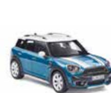
MINI COUNTRYMAN (F60) MINIATURE

Die-cast Pepper White, Chili Red, Electric Blue 80 43 2405582 -84 1:18 scale