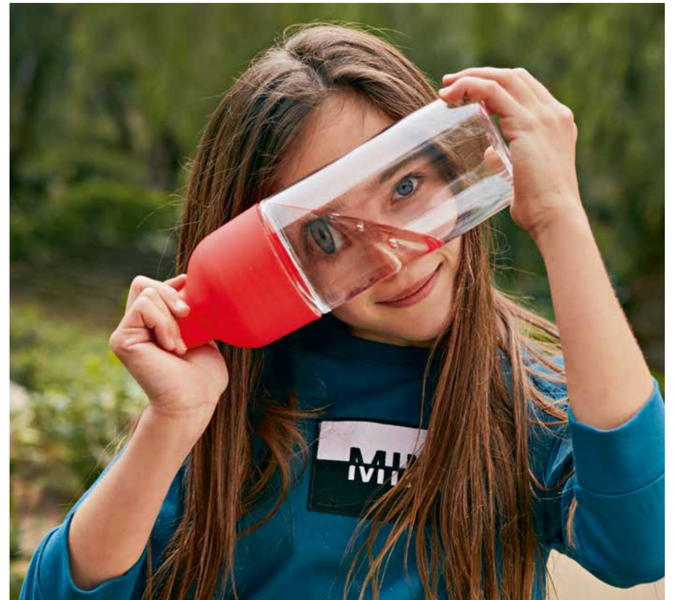
Left: Kubb Game, Signet T-Shirt Men's Right: Colour Block Water Bottle, Logo Patch Sweatshirt Kids