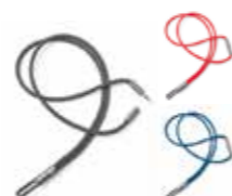
MINI TUBE LANYARD

Anodised aluminium Black/Silver, Black/Island, Grey/Coral 80 27 2460882-84 60 × 38 × 5.5 mm