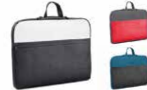
MINI COLOUR BLOCK LAPTOP SLEEVE

White/Black, Grey/Coral, Island/Black 80 21 2445661, 80 21 2460856–57 19 × 2 × 10 cm