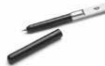
MINI FOUNTAIN PEN

FSC-certified wood Black/White 80 24 2445689 17.5 × 0.8 × 0.8 cm