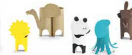
MINI KIDS CRAFT SET ANIMALS

Paper: FSC-certified Multicoloured 80 45 2460914 A5