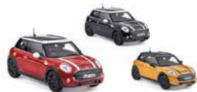
MINI COOPER S (F56) MINIATURE

Die-cast, plastic Box of 36 in 4 colours (Blazing Red, Volcanic Orange, Midnight Black, Pepper White) 80 42 2339551 1:64 scale