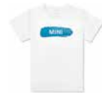
MINI WORDMARK T-SHIRT KIDS

100% cotton with UV-protection finish Grey/Coral 98-128 80 14 2460824 -29