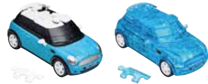
MINI HATCH COOPER S PUZZLE CAR

Deck: polypropylene Wheels: polyurethane Black/Red/White 80 23 2460916 57 × 15.3 × 13 cm