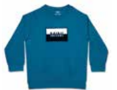
MINI LOGO PATCH SWEATSHIRT KIDS

100% cotton Coral 98-128 80 14 2460836 -41