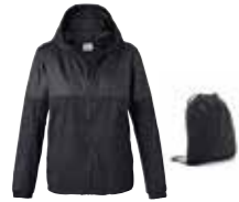
MINI JACKET WITH BACKPACK WOMEN'S

Coral XXS–XL 80 14 2454945–50 Island XXS–XL 80 14 2454951–56