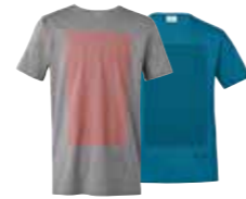
MINI SIGNET T-SHIRT MEN'S

Black/White S–XXXL 80 14 2460776–81 White/Black S–XXXL 80 14 2460782–87