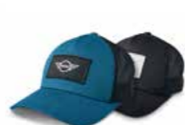
MINI LOGO PATCH TRUCKER CAP

Island, Coral, Black, White 80 16 2460850–49 80 16 2445652–51