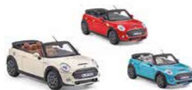
MINI CABRIO (F57) MINIATURE

Die-cast Blazing Red, Midnight Black, Volcanic Orange 80 43 2413799, 80 43 2339558, 80 43 2413800 1:18 scale