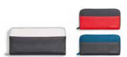
MINI COLOUR BLOCK WALLET

White/Black, Grey/Coral, Island/Black 80 22 2445667, 80 22 2460861–62 40 × 40 × 14 cm