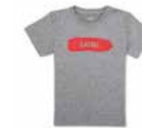
MINI WORDMARK T-SHIRT KIDS

100% cotton (soft jersey) White/Island/Coral, standard size (6 - 9 months) 80 14 2460848