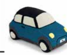
MINI KNITTED CAR

FSC-certified beech Red 80 45 2460912 16 × 9 × 7 cm