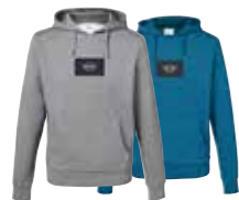
MINI LOGO PATCH SWEATSHIRT MEN'S