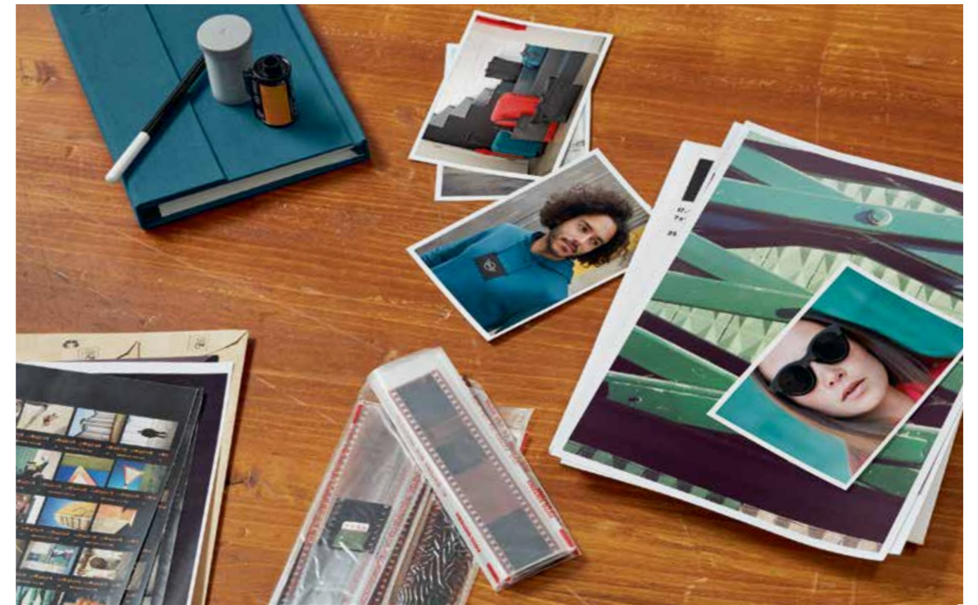
Left: Wordmark T-Shirt Women's Right: Cloth-Bound Notebook, Pencil Set, Walking Stick Umbrella, Cabin Trolley, Colour Block Shopper, Trolley, Two-Tone Totepack, Two-Tone Traveller Bag, Colour Block Duffle Bag, Luggage Tag, Logo Patch Sweatshirt Men's, Matt/Shine Panto Sunglasses

All products shown are available from your MINI Partner and can also be ordered directly from the MINI Online Shop: