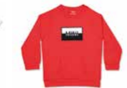
MINI LOGO PATCH SWEATSHIRT KIDS

100% cotton with UV-protection finish White/Island 98-128 80 14 2460830 -35