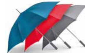
MINI WALKING STICK SIGNET UMBRELLA

100% fast dry polyester Coral, Island, Grey 80 23 2460889-90, 80 23 2445719 Closed: 27 × 6 cm Diameter: 98 cm