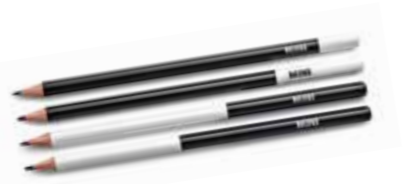
MINI PENCIL SET

Paper: FSC-certified, magnetic closure Island, Coral, Grey 80 24 2460897-95 21.6 × 15.7 × 1.9 cm