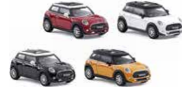
MINI HATCH (F56) MINIATURE

Plastic Box of 24 in 3 colours (Chili Red, Electric Blue, Volcanic Orange) 80 44 2447939 1:36 scale