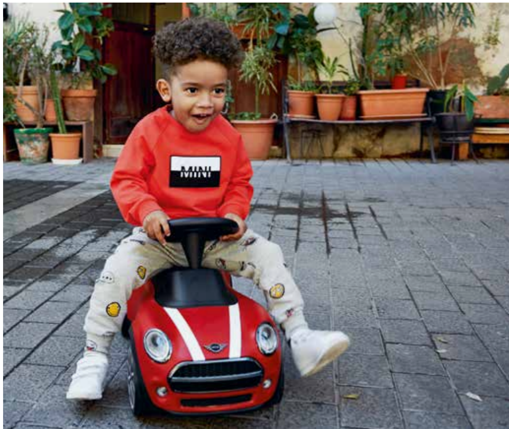
Left: Baby Racer, Logo Patch Sweatshirt Kids Right: Pull Toy Car