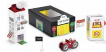
MINI KIDS CRAFT SET AUTOMOTIVE

Cardboard Multicoloured 80 45 2445730 23 × 32.5 cm