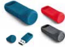
MINI USB KEY

ABS with rubber finish, 32 GB Island, Coral, Grey 80 29 2460899-98 80 29 2445703 1.8 × 1.8 × 4.5 cm