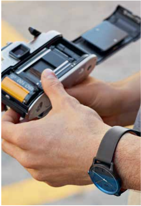
Left: Colour Block Watch Right: Walking Stick Signet Umbrella, Logo Patch Sweatshirt Men's