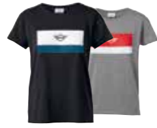
MINI WING LOGO T-SHIRT WOMEN'S

Coral XXS–XL 80 14 2454903–08 White/Black XXS–XL 80 14 2454909–14