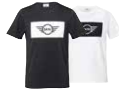
MINI WING LOGO T-SHIRT MEN'S

Grey/Coral/Black S–XXXL 80 14 2454963–69 Island/Black/White S–XXXL 80 14 2460770–75