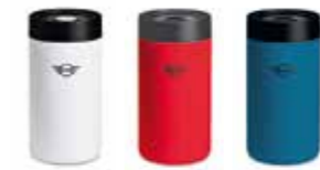
MINI TRAVEL MUG

Brushed stainless steel, hardened glass, leather White/Black, Island/Black 80 26 2460917-18 38 mm watch dial