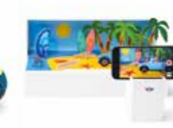
MINI MOVIE STAGE

95% cotton, 3% polyester, 2% viscose Island 80 45 2460913 26 × 14 × 13 cm