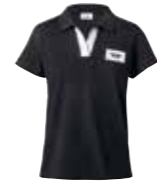
MINI LOGO PATCH POLO WOMEN'S

Grey/Coral XXS–XL 80 14 2454927–32 Island/Black XXS–XL 80 14 2454933–38