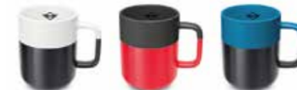
MINI COLOUR DIP CUP

100% BPA-free polymer Island, Coral, Grey 80 28 2460908-06 Capacity: 0.7 l